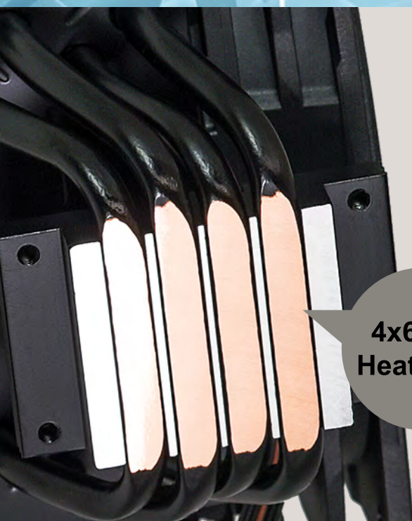
4x6 mm Heatpipes

Thanks to the gapless H.D.C – technology the four high performance heatpipes have direct contact to the CPU. This allows rapid and safe heat dissipation to the heatsink.