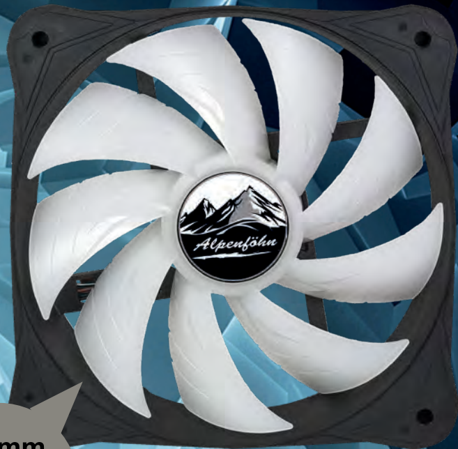
130mm RGB Fan

The new Ben Nevis Advanced Black RGB has been equipped with a 130mm RGB cone PWM fan and so provides sufficient airflow to achieve the perfect balance between noise and performance and brings color into the case. By integrating four high-end heat pipes we have managed to increase the cooling output to 150W TDP.